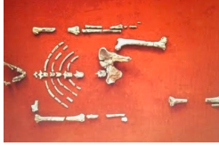
“Lucy”, the Oldest, Most Complete Fossil Skeleton *