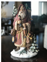
*** Father Christmas