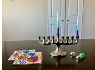
** First Night of Hanukkah