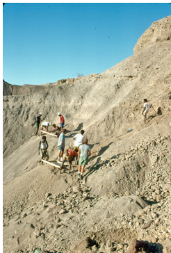
“First Family” sediments that are being excavated

* National Geographic December 1976, Ethiopia Yields “First Family” of Early Man , authored by D. Johanson, and D. Brill (who took the photos)