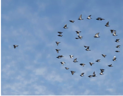
Birds in Flight