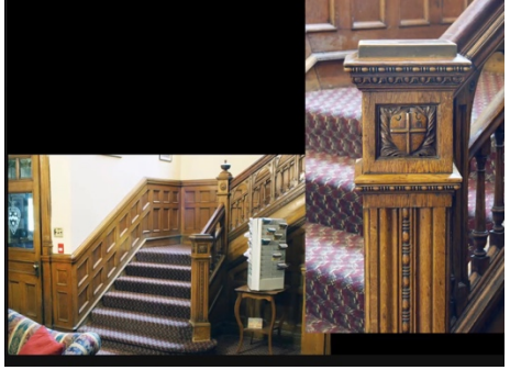
Interior of Matthews House