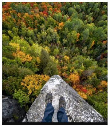
Nature 100 Feet Down