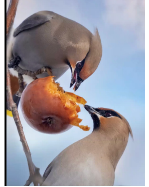
Birds in Action