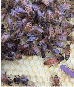
A Queen Bee in a Hive