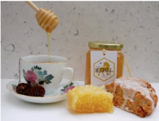
From the Hive to the Table