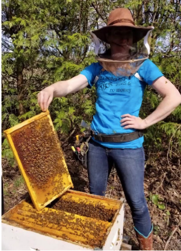
Beekeeping is wonderful hobby but not for everyone!